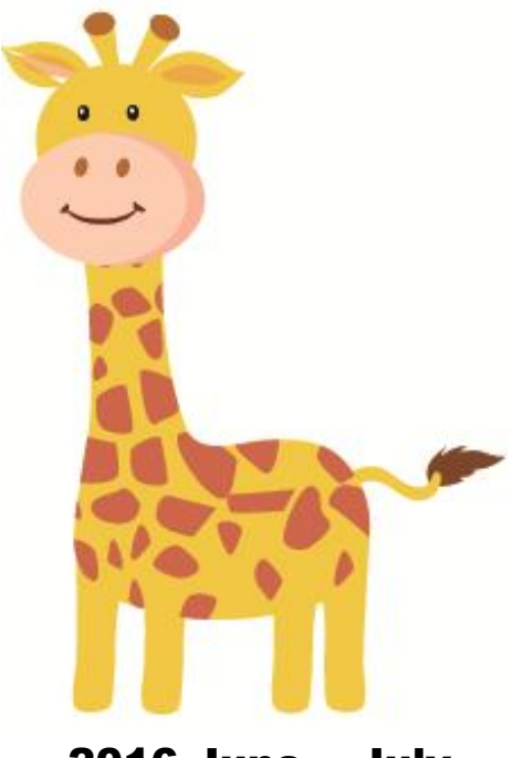
2016 June ~ July Giraffe Class Newsletter