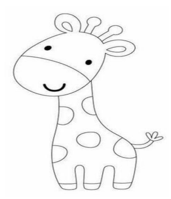
Giraffe Class Newsletter February 2017