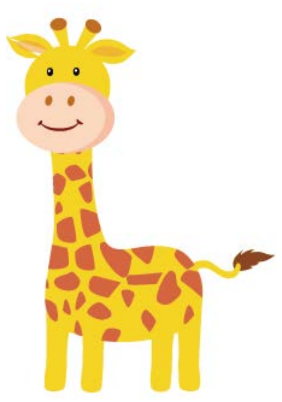
Giraffe Class Newsletter 2017 May