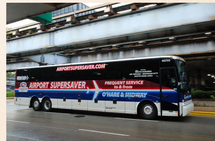
3. Airport shuttle bus.