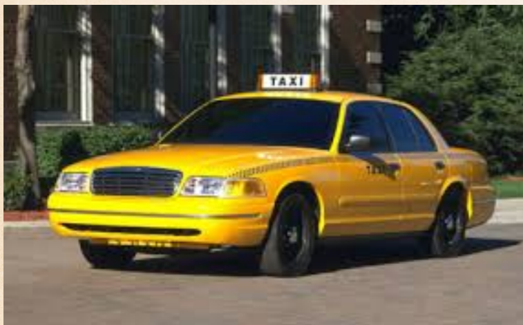
1. A taxi

Starting my journey, I packed my bags and called a taxi. The taxi picked me up from my house, and took me to the Taichung High Speed Train station. I bought a ticket, and took the HSR to the Taoyuan HSR station. From there, I got on the shuttle bus, and took the shuttle bus to the Taoyuan International Airport. So far, I had used three kinds of transportation. 1. A taxi 2. The High Speed train 3. The Airport shuttle bus.