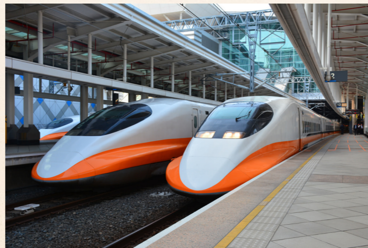
2. High Speed train