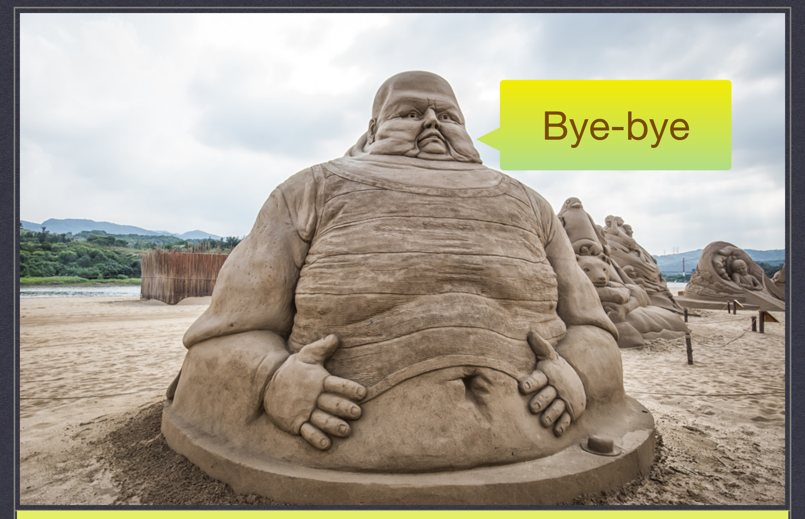
Thank you for listening to my presentation. I hope you enjoyed it!