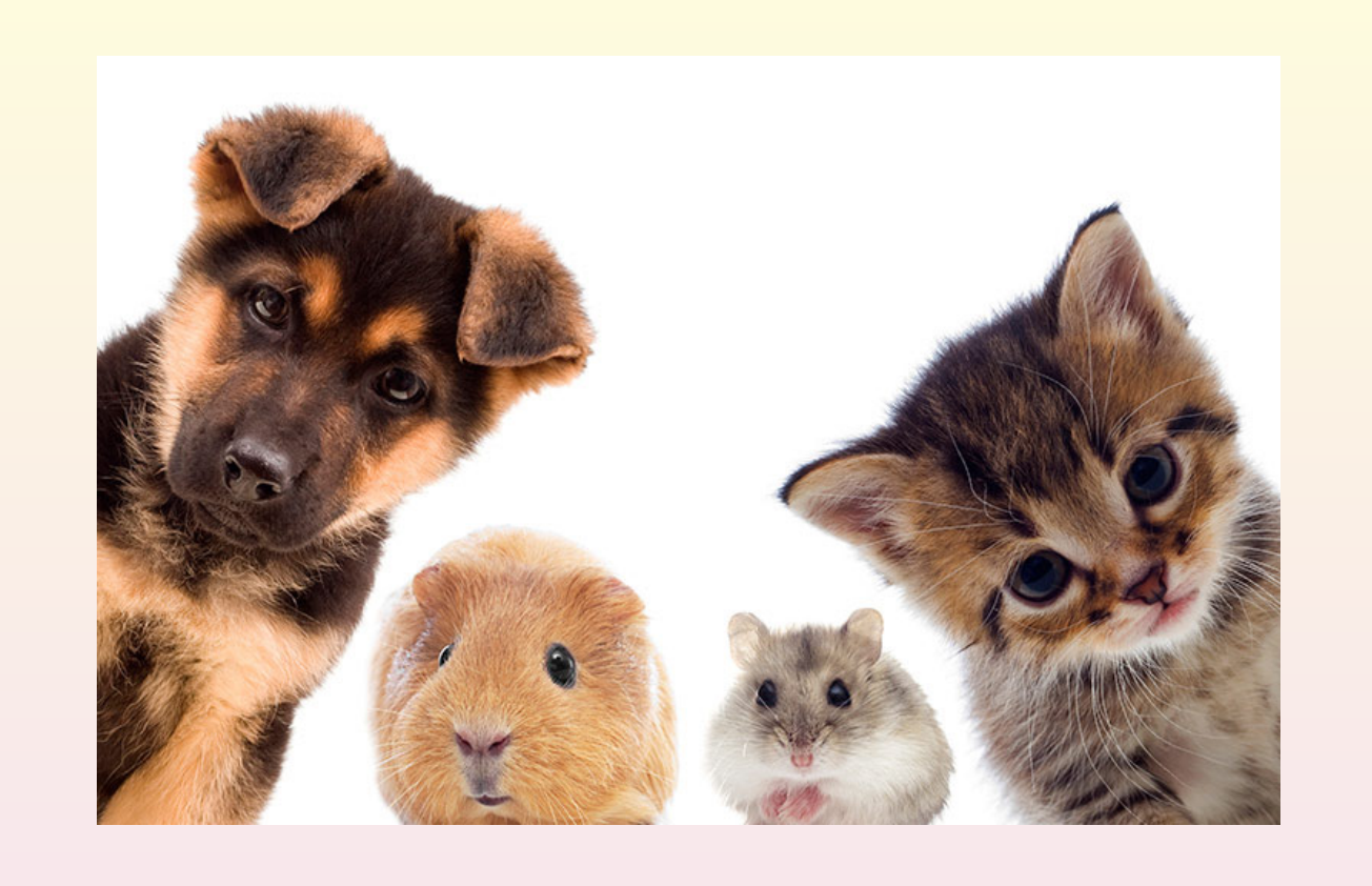
Why do we need pets? Pets are great for people of any age. They help with learning responsibility. Pets are also great for good health and happiness.